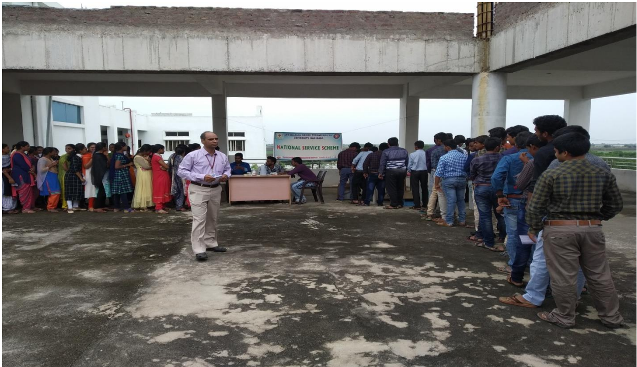
Students filled the registration and attended the blood grouping camp