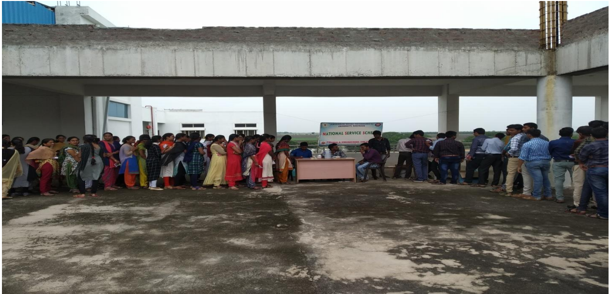
Students participating in the blood grouping camp and registration process

Jonnalagadda, Narasaraopet Guntur - 522601, Dist. A.P. Website:tecnrt.org. E-mail:tecnrt@gmail.com