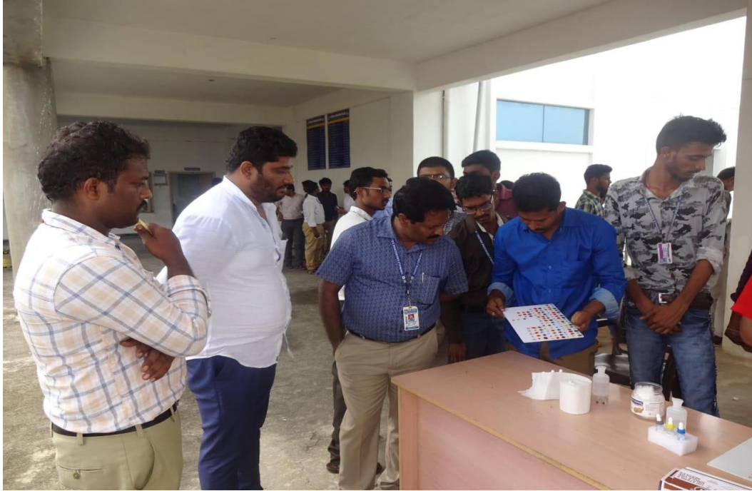
Technical person explaining to Principal sir at the camp

Jonnalagadda, Narasaraopet Guntur - 522601, Dist. A.P. Website:tecnrt.org. E-mail:tecnrt@gmail.com